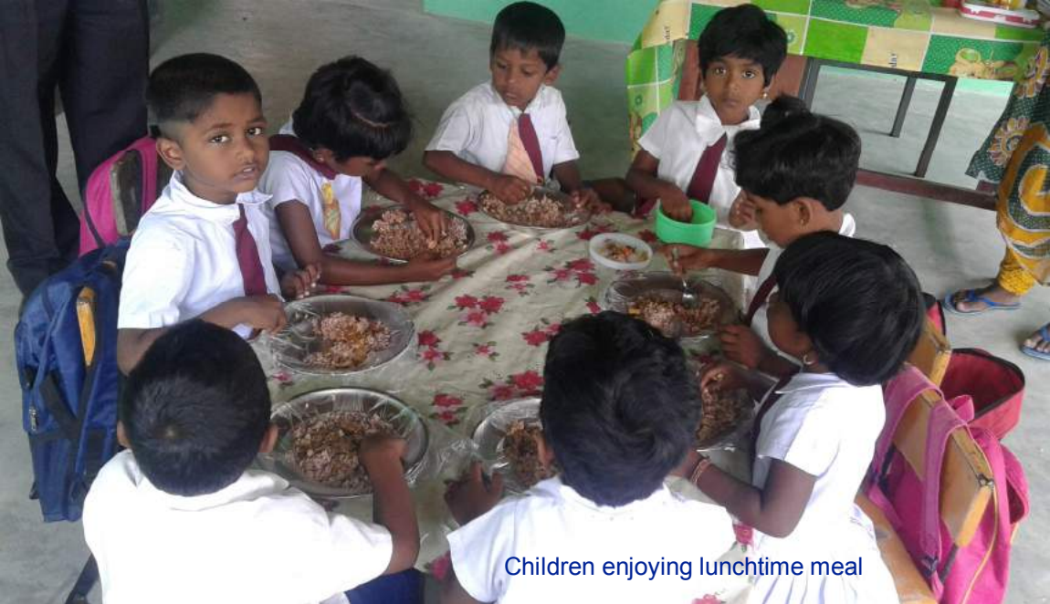
Children enjoying lunchtime meal

earlier years, some parents of the children volunteered to cook the meals. Now the schools rely on cooks to whom no payment is made in cash or kind. At present, the parents of the children who receive OP benefits have been asked to chip in to pay the cooks something for their time and labour.