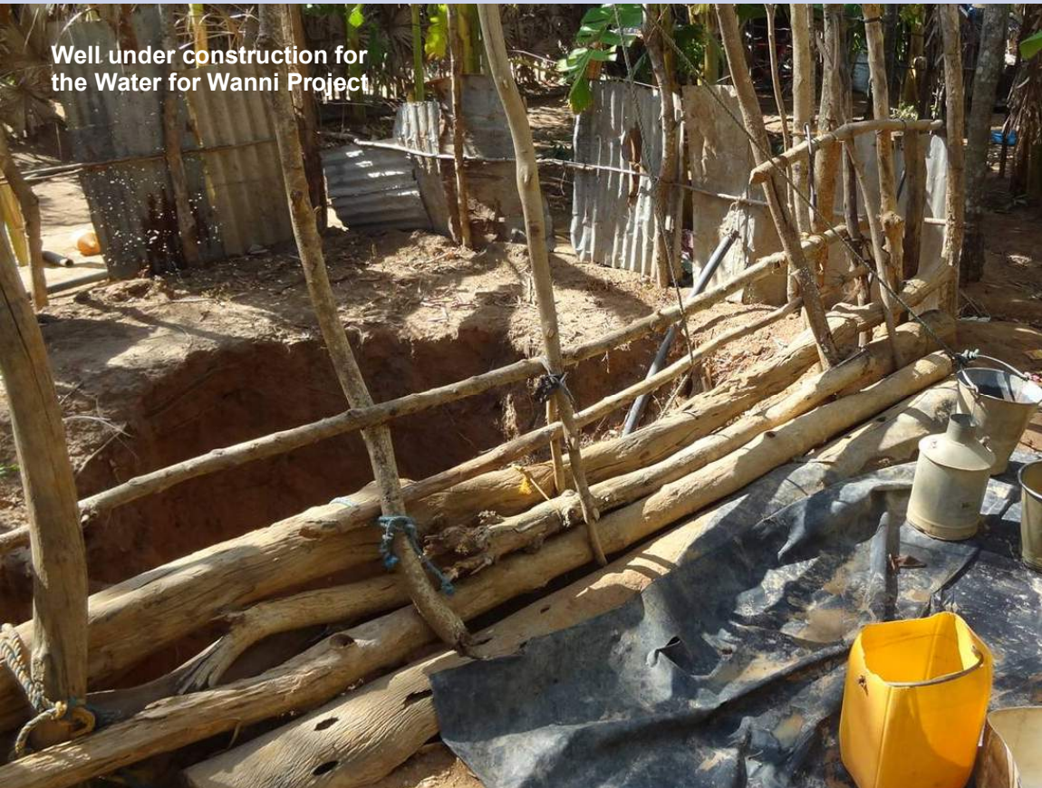
Well under construction for the Water for Wannu Project

We thank all the generous donors who have contributed to the Water for Wannu project, as their help has made a huge difference to the lives of many families in the Wannu.