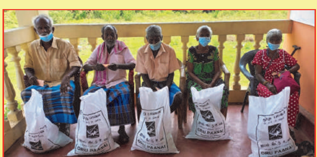
Dry rations to recipients in Vavuniya