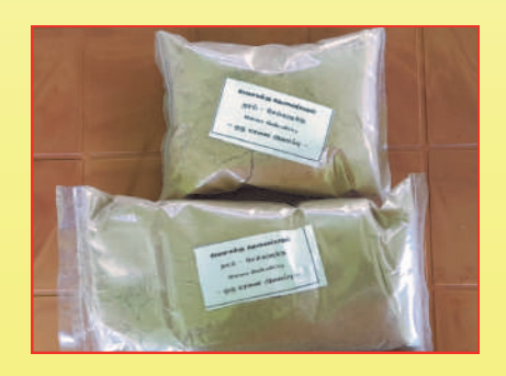
Sathu Maa packets distributed by OP