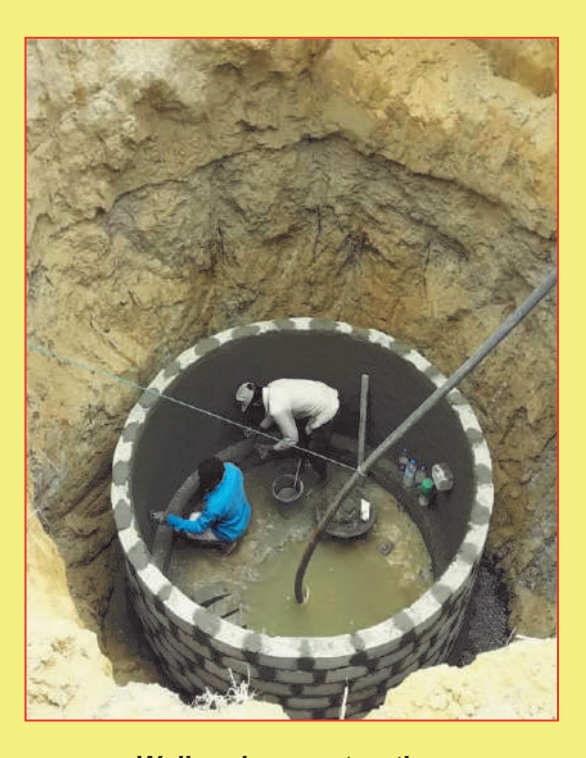
Well under construction