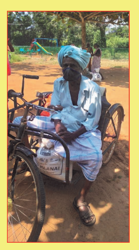
Dry rations - Mallavi